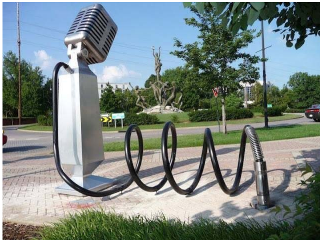
Microphone Bike Rack – Nashville, TN