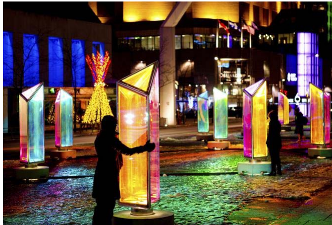
Prismatica – Montreal, QC