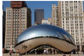
Millenium Park – Chicago Bandshell by Frank Gehry Sculpture - Cloud Gate by Anish Kapoor